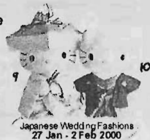
Japanese Wedding Fashions 27 Jan - 2 Feb 2000

In most urban societies divorce, crime, drug and alcohol abuse, materialism, lack of civility in behavior abound. Lack of integrity and intolerance are serious and growing problems. People fight over queuing for Hello Kitty toys and staring at each other. We seem to be living in a world that a New Testament writer described nearly two thousand years ago: